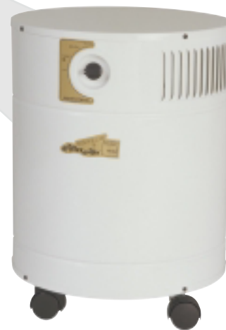
Model 5000 EXEC